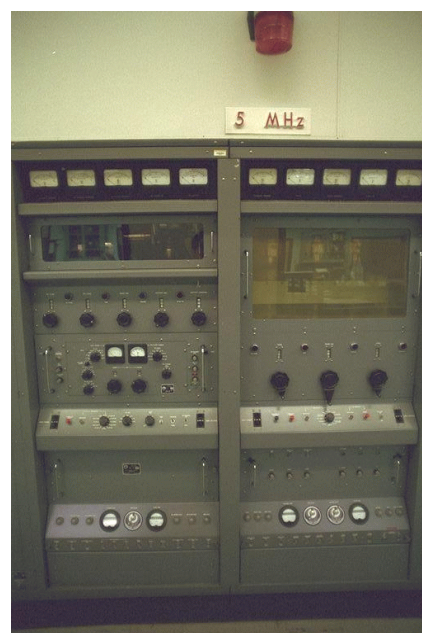
Current 5 MHz Transmitter

The station moved again in December 1932, this time to a 10 hectare (25 acre) Department of Agriculture site near Beltsville, Maryland. By April of 1933, the station was broadcasting 30 kW on 5 MHz,